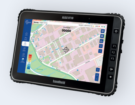
'A uniform interface for all our sensors'